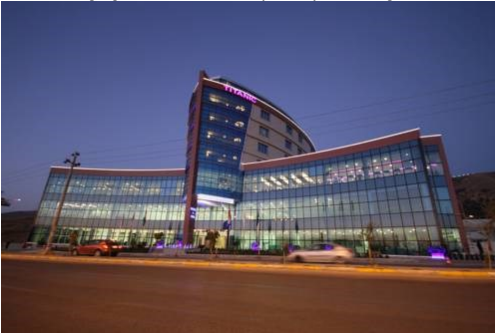
Titanic Hotel Sulaymanya

The overriding aspect here is undoubtedly healthy and damage-free construction.