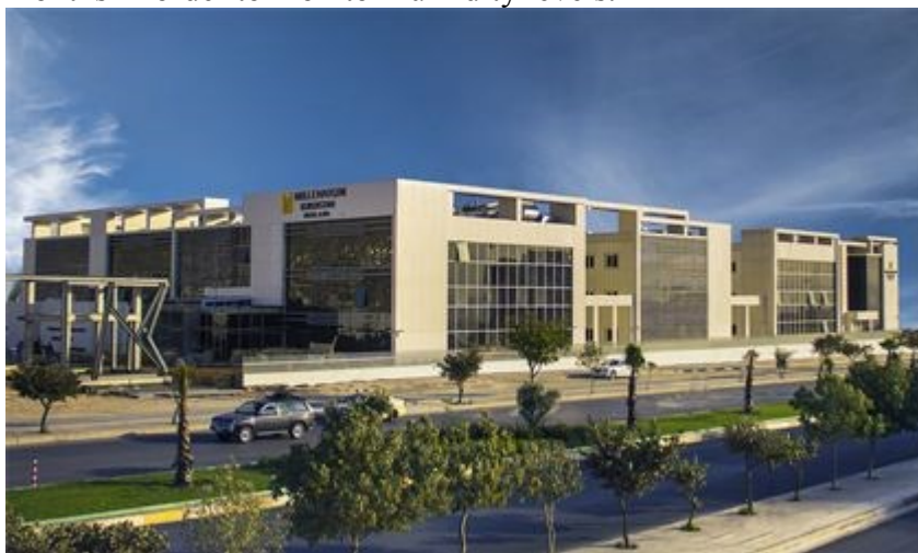
Kurdistan Millennium Hotel & SPA

content in the room air compared to before the renovation. This difference can be offset by adjusting the ventilation methods via windows or using a mechanical system. Mold growth is avoided if a high level of relative humidity is also permanently prevented at unfavorable sections of exterior building components (thermal bridges) through the use of sufficient heating and ventilation. As people are unable to sense the level of relative humidity in their environment – in contrast to their ability to feel temperature changes – it is highly recommended to use a hygrometer during the winter months in order to monitor humidity levels.